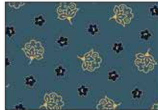
Outlined Flower - Blue 9917-77