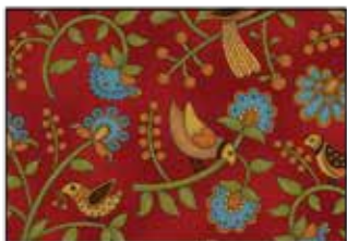
Birds and Flowers - Brick Red 9914-88