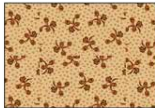
Buds and Dots - Beige 9916-44