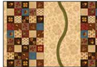
Stripe w/ Vine - Beige 9919-44