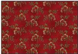
Flower Sprigs - Brick Red 9920-88