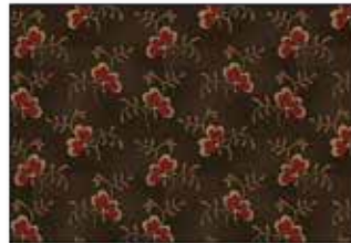
Flower Sprigs - Brown 9920-33