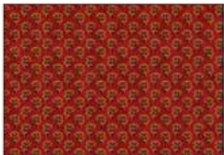
Set Tiny Flower - Brick Red 9915-88