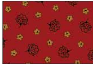
Outlined Flower - Rust 9917-83