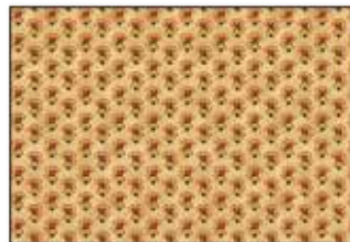
Set Tiny Flower - Beige 9915-44