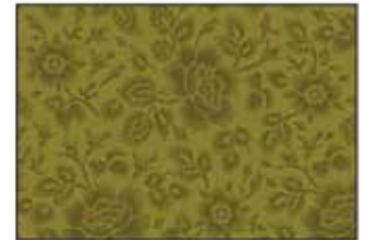
Damask Floral - Green 9918-66