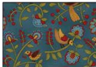
Birds and Flowers - Blue 9914-77