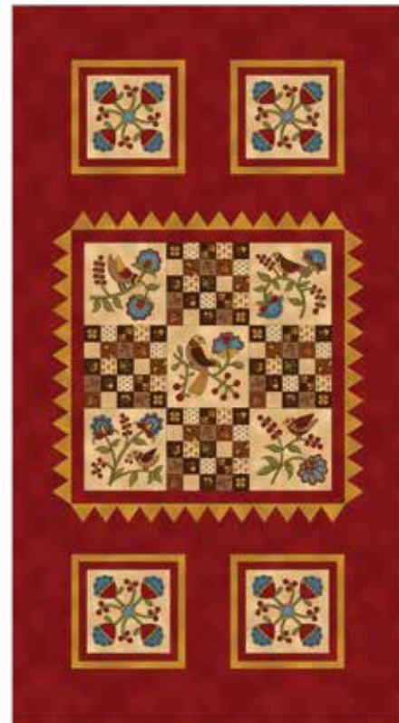
Panel - Brick Red 9913P-88