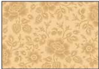
Damask Floral - Beige 9918-44