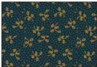
Buds and Dots - Blue 9916-77