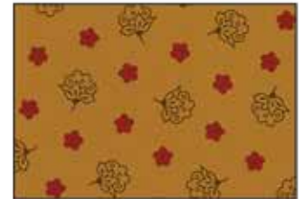
Outlined Flower - Ochre 9917-34