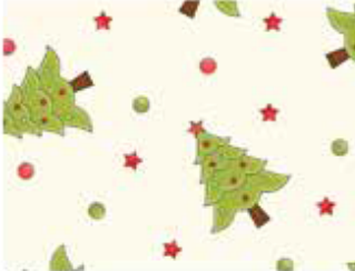
Christmas Tree Toss - Cream 8295-44 Fabric D & Backing