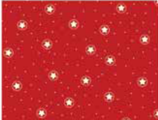
Dots and Stars - Red 8297-88 Fabric C