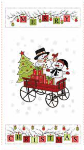
Purely Christmas Panel - Red 8301P-08 Fabric A