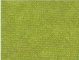
Texture - Green 8300-66 Fabric B