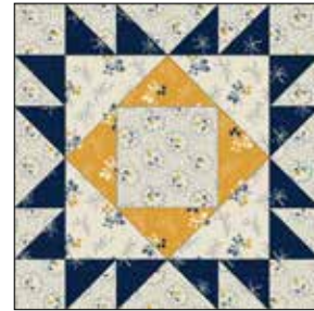
Blue Cheese Block

Sew a Unit D to the top and bottom of Unit C to complete the Blue Cheese Block. Repeat to create 20 Blue Cheese Blocks.