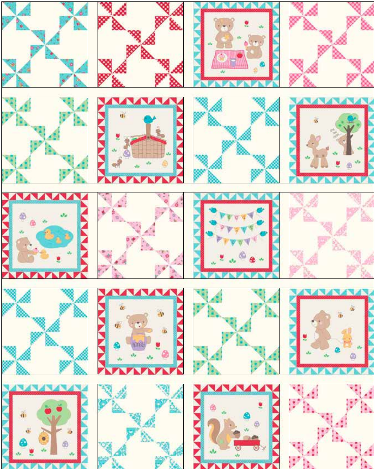
Quilt Center Diagram